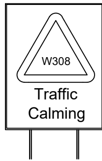
HIGH VISIBILITY TRAFFIC CALMING SIGN